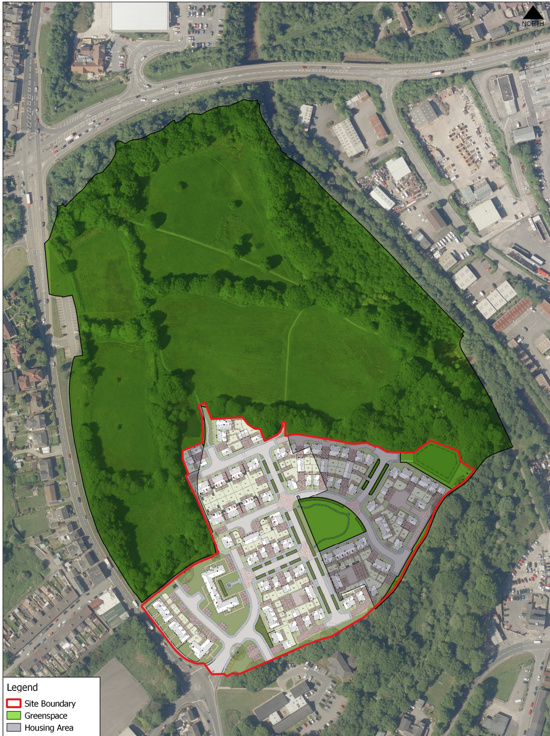
Figure 1: Plan illustrating overlap of application site and Leisure allocation LE1.9 including areas of formal/informal open space within the development site/leisure allocation overlap.